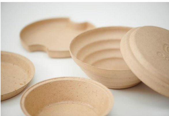
Upcycling tableware “edish” made from food waste

Marubeni Corporation (“Marubeni”) has been selected to participate in the Co-Design Challenge, a special program for companies involved in the management of the Japan International Exposition, 2025 (hereinafter, “Osaka-Kansai Expo”), which was publicly solicited by the Japan Association for the International Exposition, 2025.