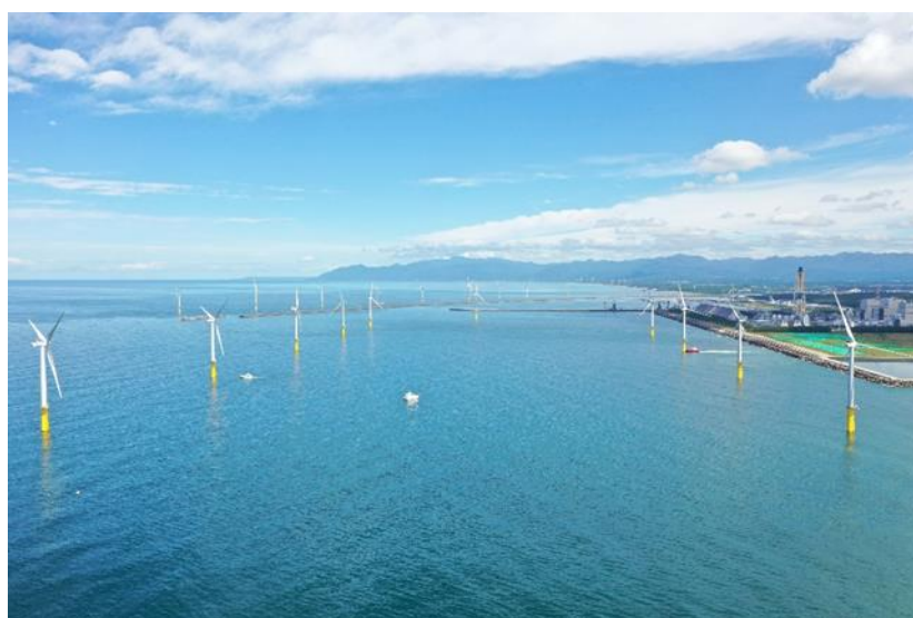
Noshiro Port Offshore Wind Farm

Marubeni is pleased to announce that it started commercial operation based on the feed-in tariff program for renewable energy (hereinafter, “FIT”) at the Noshiro Port Offshore Wind Farm on December 22, 2022.